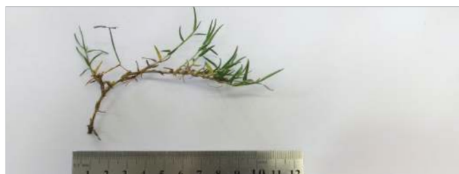
Fig 3. close-up of live stolon