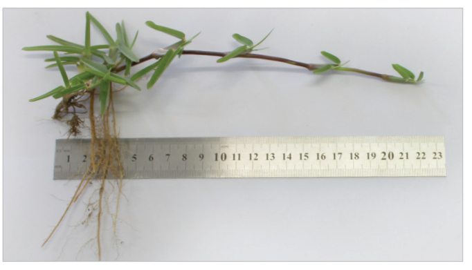
Fig 3. close-up of live stolon